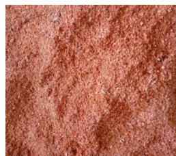
Figure 2. Sawdust [4]

On the other hand, it can be a useful raw material in different ways when treated well. According to Koteswara [36], sawdust can be used for various functions, including soil stabilizer, because of its pozzolanic properties. Also, sawdust is used in the manufacturing industries as a raw material for wood boards and, at times, used as fertilizers in agriculture [34], [37].