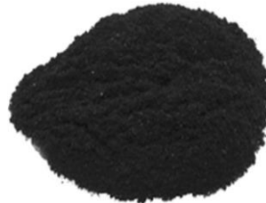
Figure 3. Sawdust ash [30]

Sawdust mainly consists of a high percentage of carbon (60.8%) and Oxygen (33.3%), and low percentages of other chemical elements such as hydrogen and nitrogen [37]. Therefore, it has inadequate cementitious properties, but it can react chemically in moisture and forms cementitious compounds [30]. This reaction can be paramount significant to the improvement of the strength and compressibility characteristics of subgrade soils. The effective utilization of sawdust will help improve soil strength properties, making them suitable for road construction.